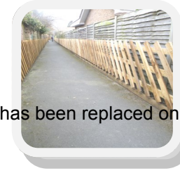
The fencing has been replaced on the Cinder path.

Five pieces of land owned by the council have been registered with the Land Registry. As a result of creation agreement between WAPC and NYCC in July 2014 Beech Lane is now registered as Public Footpath No:30.22/3T in the Parish of West Ayton.